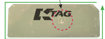
Figure 3 – Example of properly install K-TAG

There should be minimal air around the ASIC chip